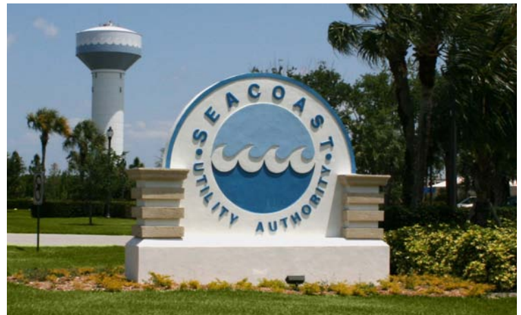
Client: Seacoast Utility Authority Site Area: 40 acres